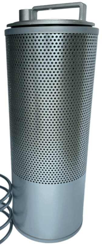
HYDRAULIC OIL RETURN FILTER